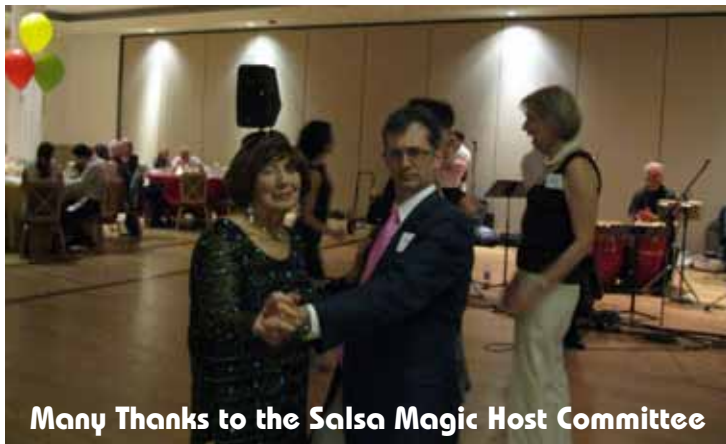
Many Thanks to the Salsa Magic Host Committee

VISIT US AT WWW.AGUDASACHIM.ORG - AA IS NOW WIRELESS!